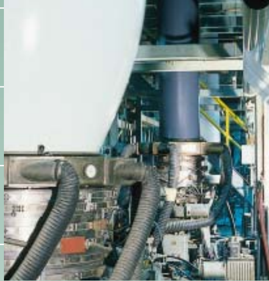
Extruders operate 24 hours a day with chilled-air rings, providing a quality product.