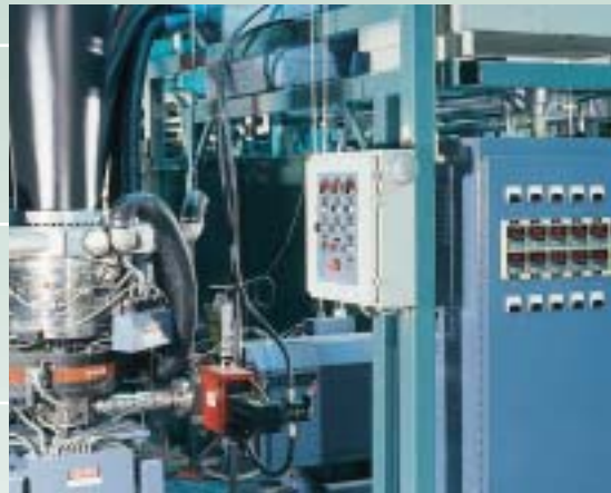
Modern equipment provides efficient operations and savings.