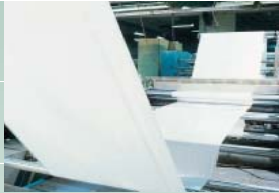
The winding process turns out millions of rolls of polyethylene, ready for shipment nationwide.